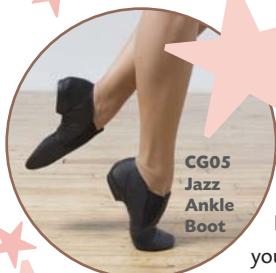
CG05 Jazz Ankle Boot