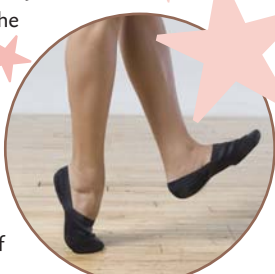
New! FF01 Freeform—engineered to form to and move with the foot, while providing support and protection. The unique styling allows it to be a perfect fit for a variety of dance disciplines, including ballet, jazz, modern and contemporary.