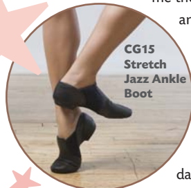
CG15 Stretch Jazz Ankle Boot